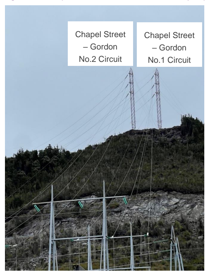
Figure 1 Chapel Street – Gordon 220 kV circuits (entry to Gordon 220 kV substation)