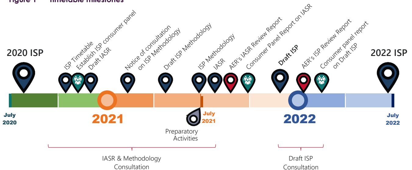
Figure 1 Timetable milestones

The following diagram outlines the key milestones for the 2022 ISP. The dates for these milestones are presented in Table 1. Further information about the purpose of these milestones and their role in the wider ISP process is presented in the following sections of this report.