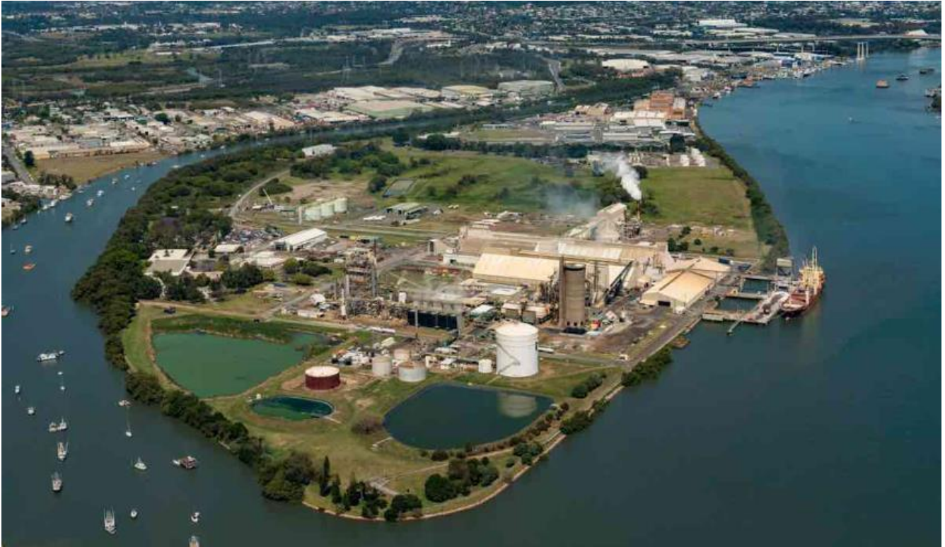
Figure 1 Gibson Island, Brisbane

Connection to Powerlink's transmission network by means of a network augmentation is required to allow electricity produced by renewable generation to power the proposed project.